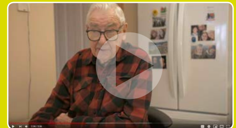
SSCF 50th Anniversary Celebration video - Part 3

Check out our whole series of videos at: http://tiny.cc/SSCFYouTube