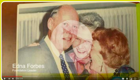
SSCF 50th Anniversary Celebration video - Part 1

We are grateful for our past, present and future!