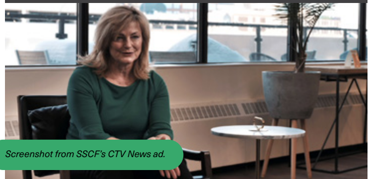
Screenshot from SSCF's CTV News ad.