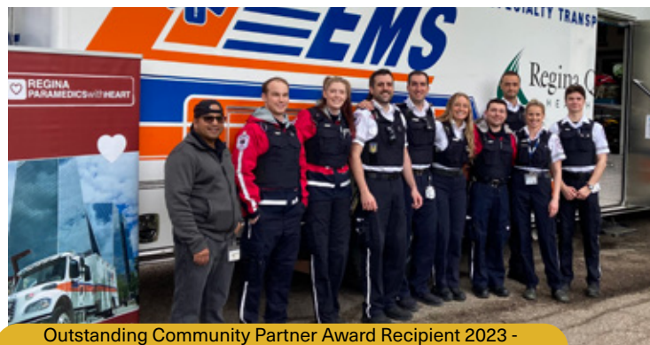
Outstanding Community Partner Award Recipient 2023 - Regina Paramedics with Heart